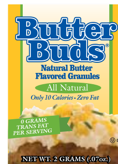
Butter Buds 2 gram Packets Product # 20005

Simply tear open packet and sprinkle Butter Buds directly on hot, moist foods like baked or mashed potatoes, rice, vegetables, noodles and fish. Add rich buttery flavor without the guilt.